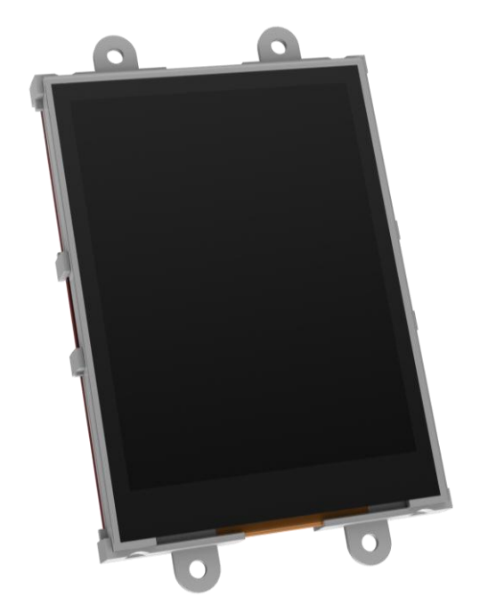
The uLCD-28-PTU Display Module